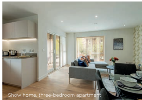
Show home, three-bedroom apartment