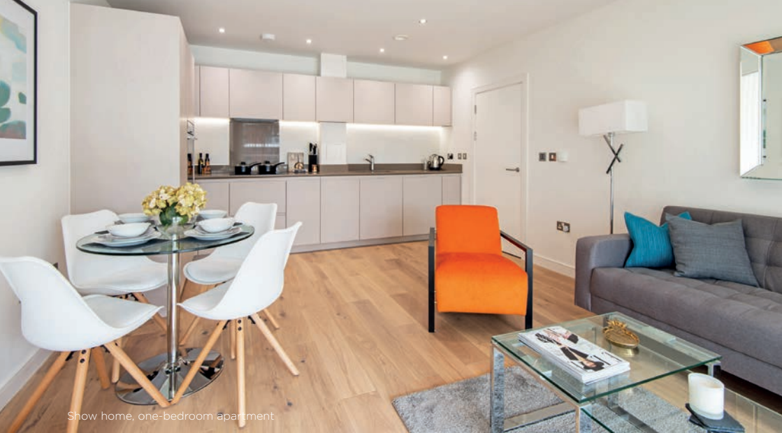
Show home, one-bedroom apartment